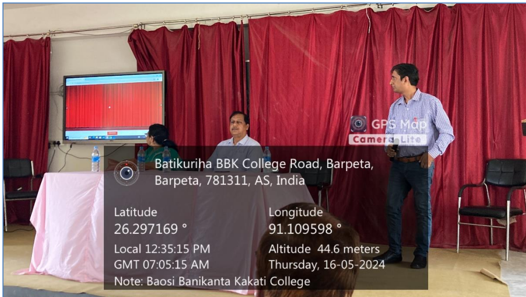
Fig.1: Snapshot of Inauguration session of BBK College App