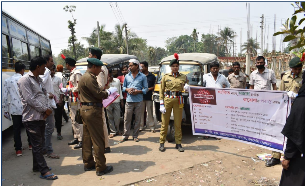
Cadets marching with the banner