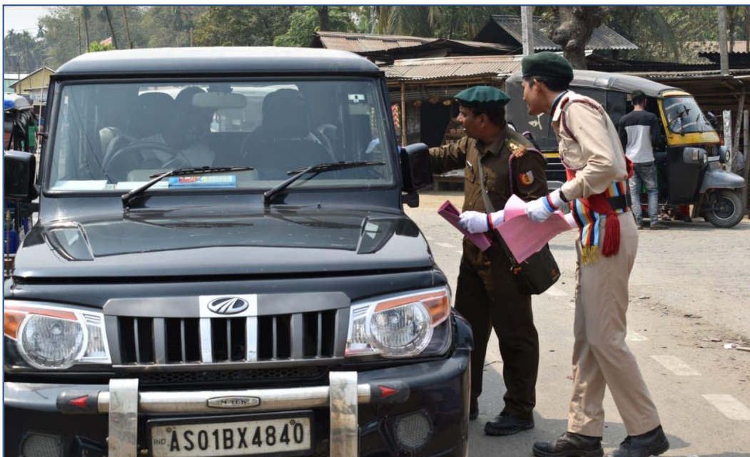
ANO and NCC Cadet distributing flyer