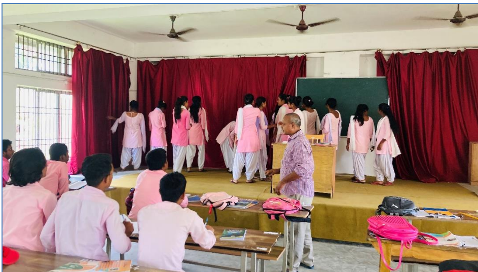
Fig.1: Snapshot of the students taking part in participative learning.

The session ended with a positive note that more such sessions would be conducted in future for a better learning experience among the students.