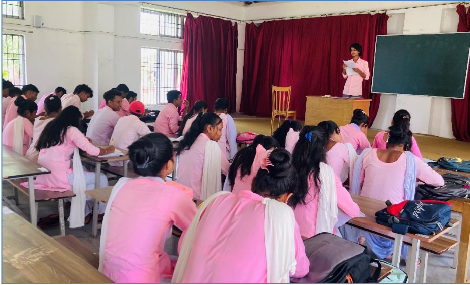
Fig.2: Snapshot of a student taking part in listening skills activity