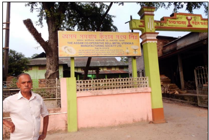
Fig.6. Snapshot of Assam Co-operative Bell-Metal Manufacturing Society Utensils Ltd