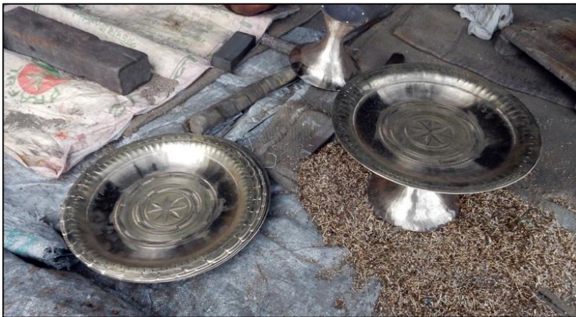
Fig.5. Snapshot of final products