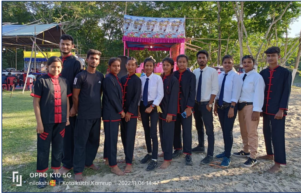
Fig.2: The Participants with their certificates and medals