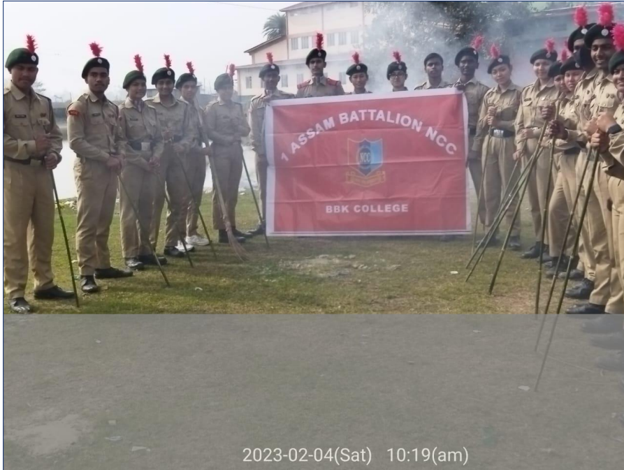
Fig. 5: The NCC Cadets with their Banner