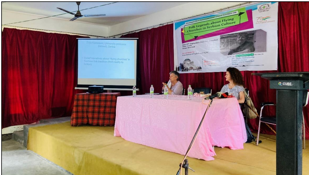
Fig.3. Snapshot of the participants