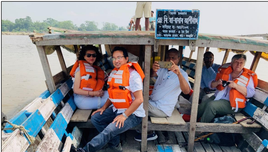
Fig.3. Snapshot of the Resource persons from Serbia