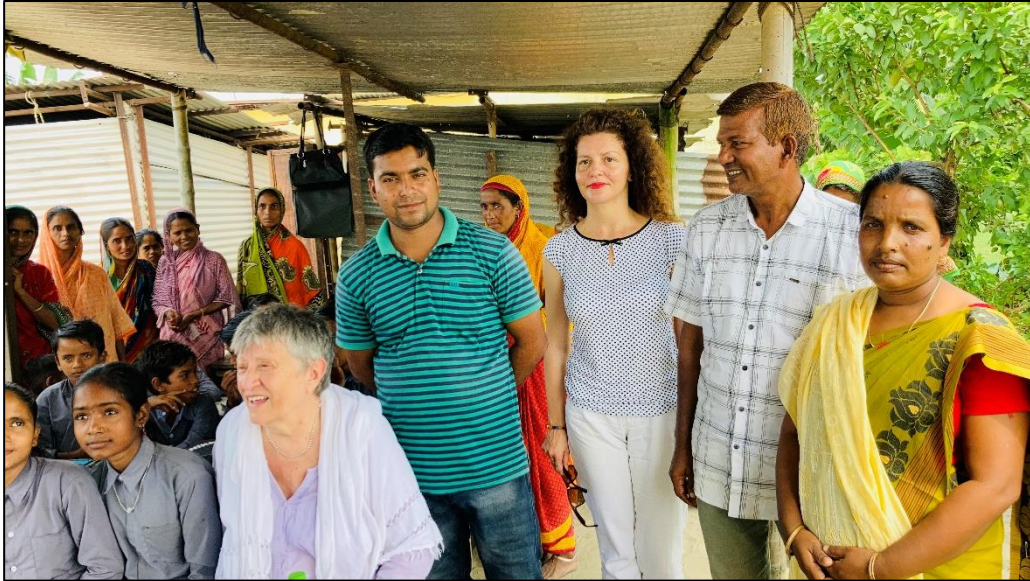
Fig.5. Snapshot of the team with the students of Tarabari Char Prathamik Vidyalay