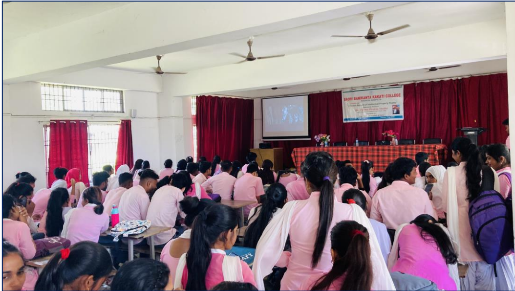
Fig.2. Snapshot of screening of 'The Elephant Whisperers'