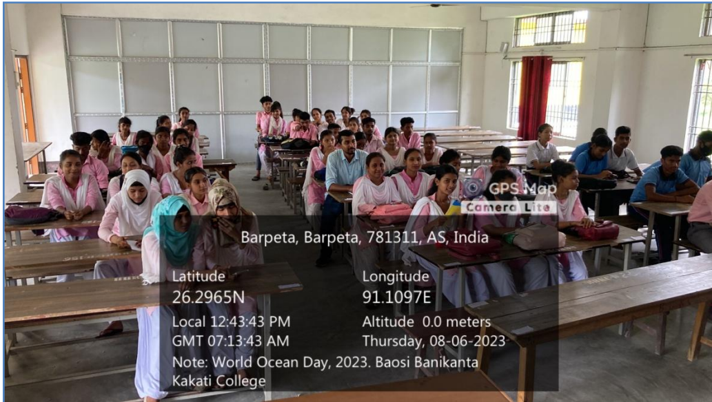
Fig.3: Snapshot of the participants