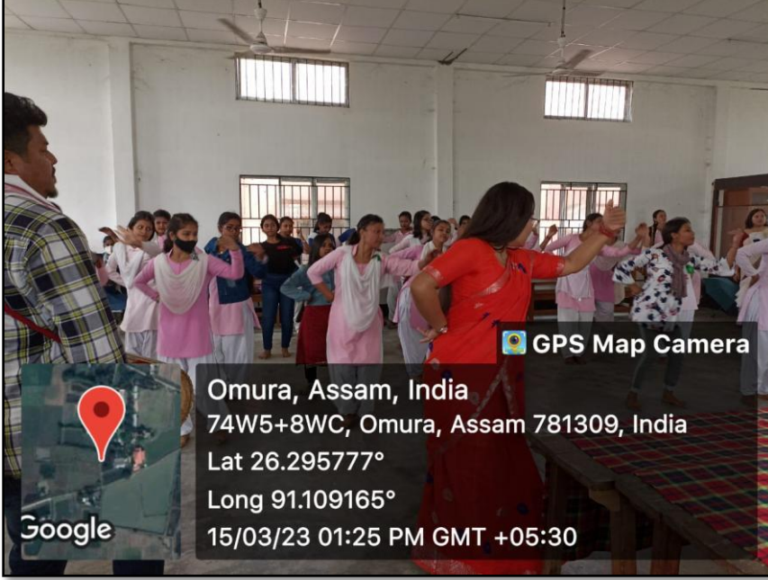
Fig.: Snapshot of ongoing program