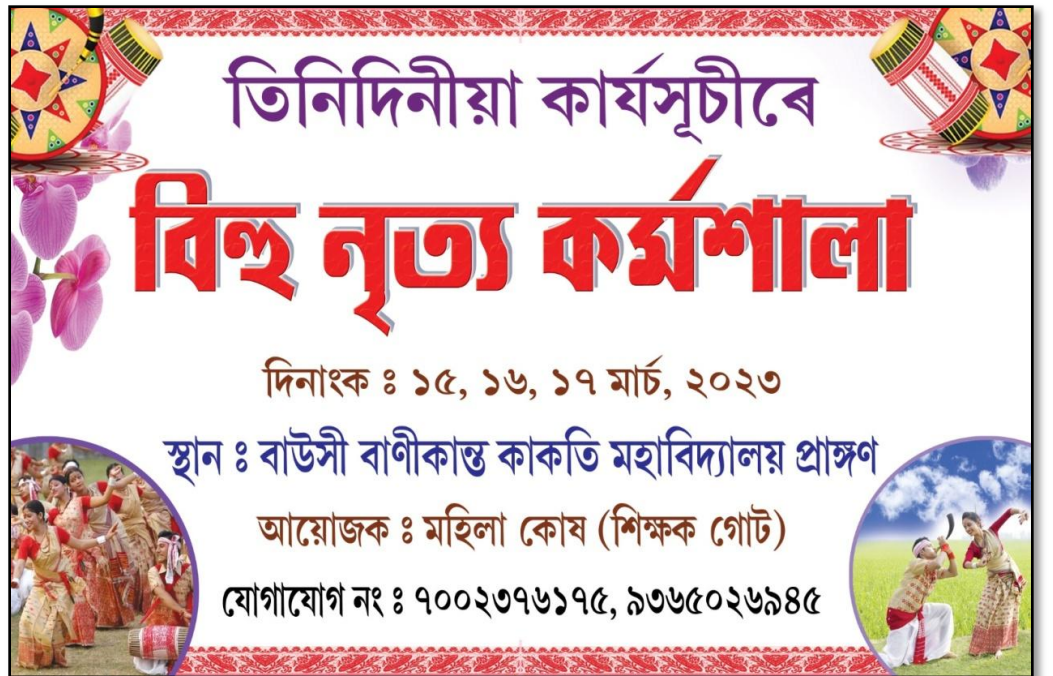
Fig.: Poster of the Three Days Bihu Workshop