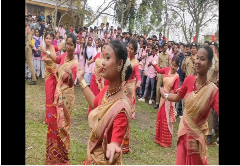
Figs.: Snapshots of students performing Mukoli Bihu on the concluding day of workshop