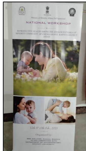
Fig.10: The Standee of the workshop