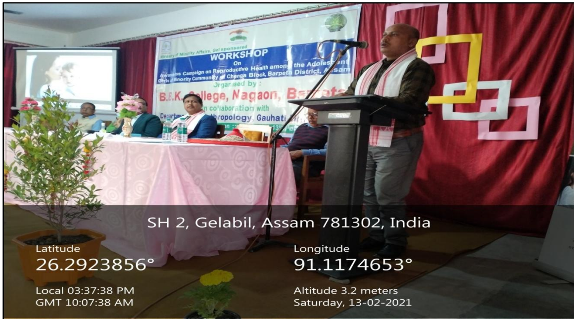
Fig.6: Snapshot of Students and Faculty members during Valedictory session