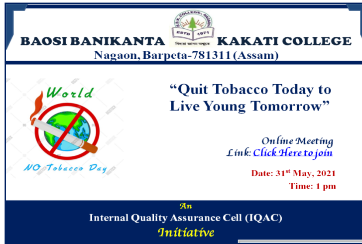
Fig: The flyer for circulation among students and faculty members