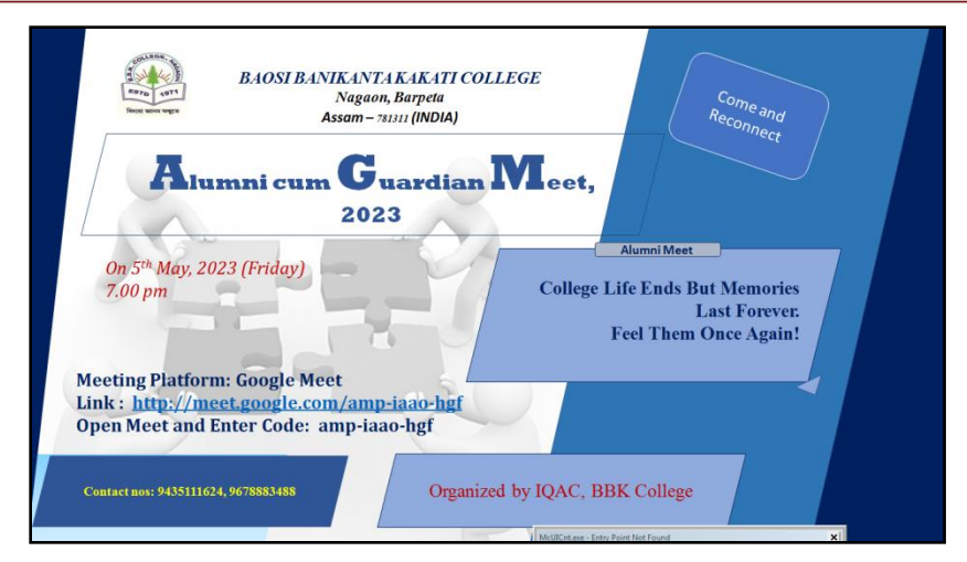
Fig.: The Flyer