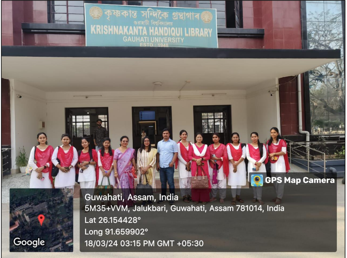
Fig.5: Snapshot of students in front of KK Handique Library, Gauhati University