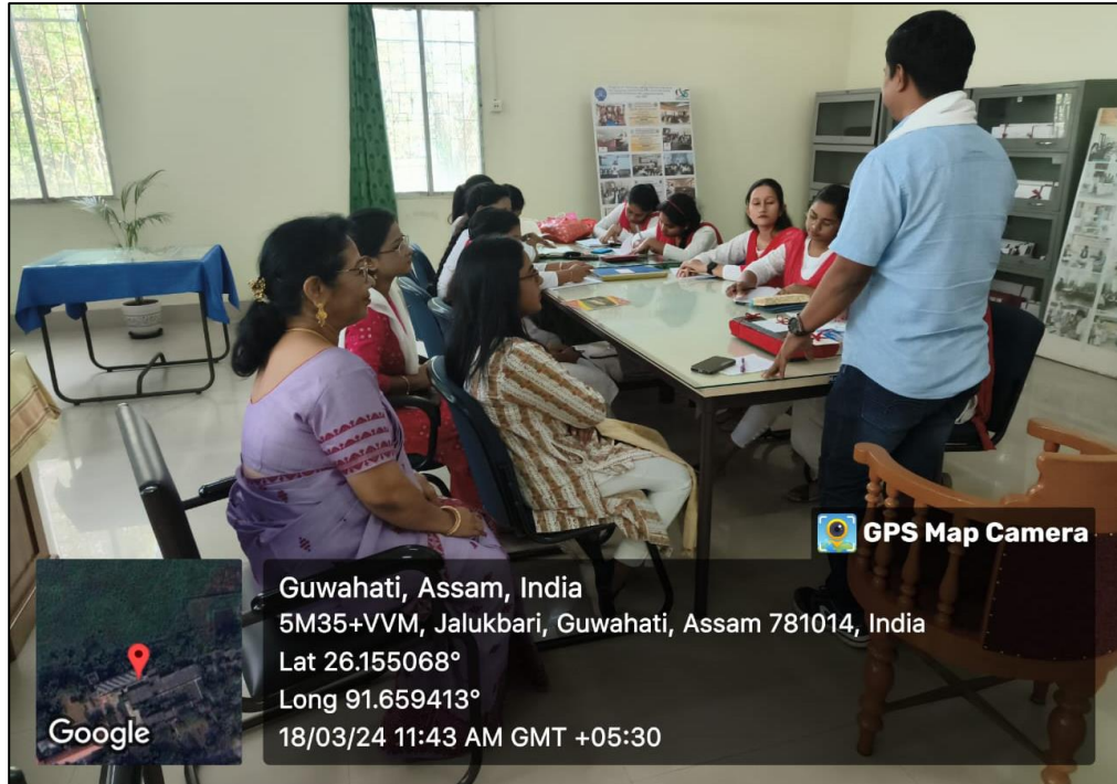
Fig. 4: Snapshot of the workshop