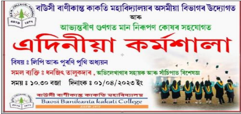
Fig.: Snapshots of the Banner of the workshop